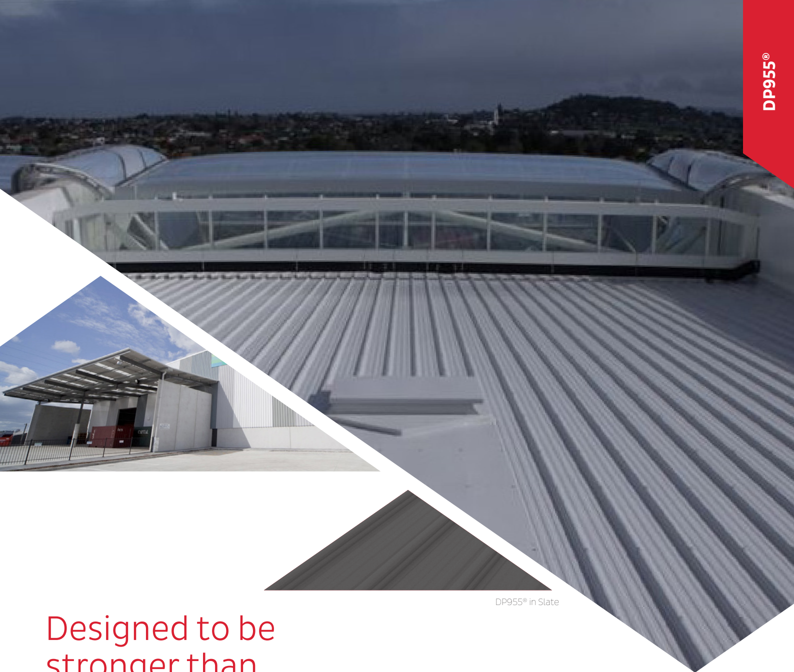
DP955® in Slate