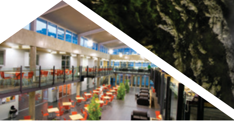
Hunter Centre, University of Otago