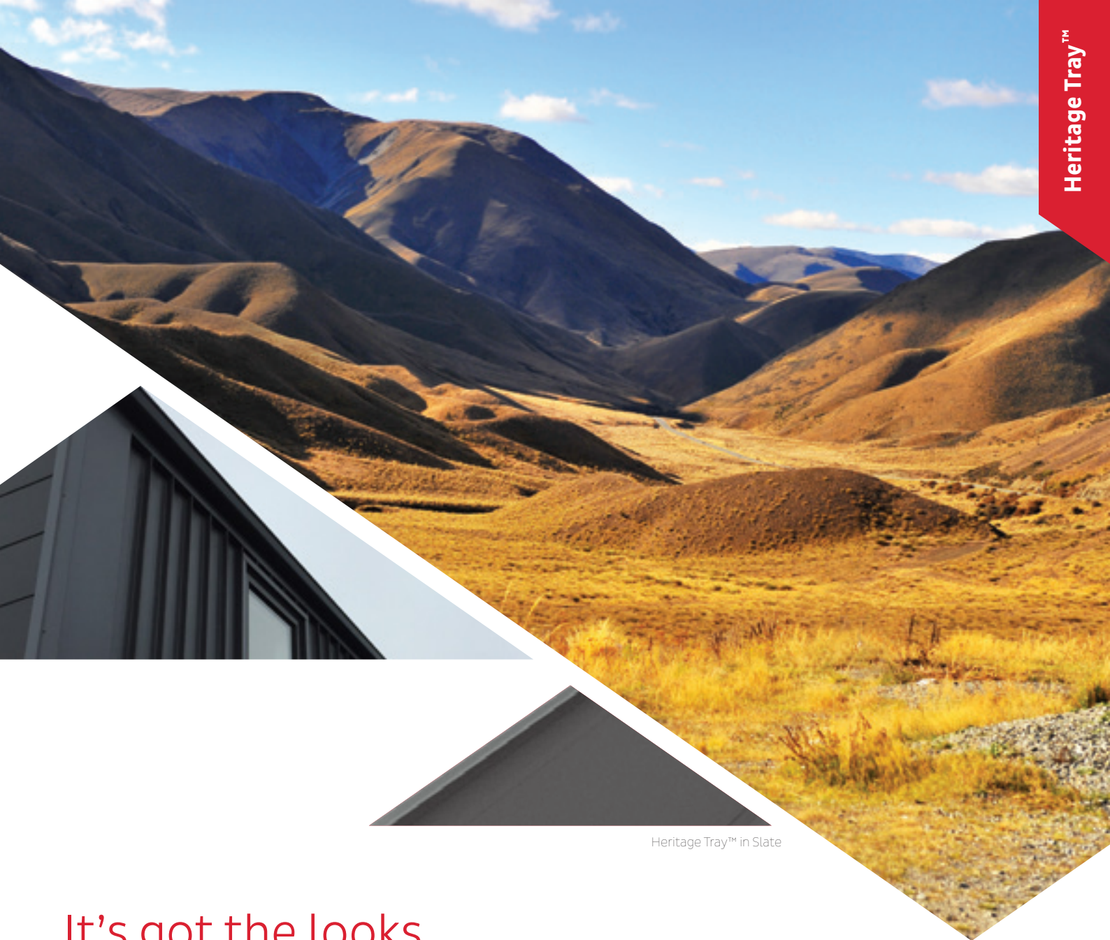
Heritage Tray™ in Slate